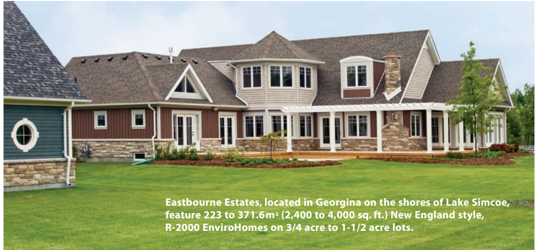
Eastbourne Estates, located in Georgina on the shores of Lake Simcoe, feature 223 to 371.6m 2 (2,400 to 4,000 sq. ft.) New England style, R-2000 EnviroHomes on 3/4 acre to 1-1/2 acre lots.

(Reprinted with permission from ArcelorMittal Dofasco Steel Design, 2008)