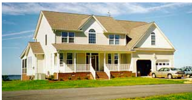
Figure 4 - Leonardtown, Maryland, Site on lower Potomac River