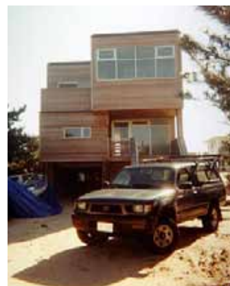
Figure 8 - New Jersey Site

and/or moisture on the samples. The third colony was in a steel-framed exterior wall on the second floor.