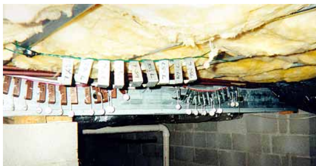
Figure 5 - Stud specimens in Leonardtown Site crawlspace. Note the uncoated C-sections in the background show red rust after just two months of exposure.