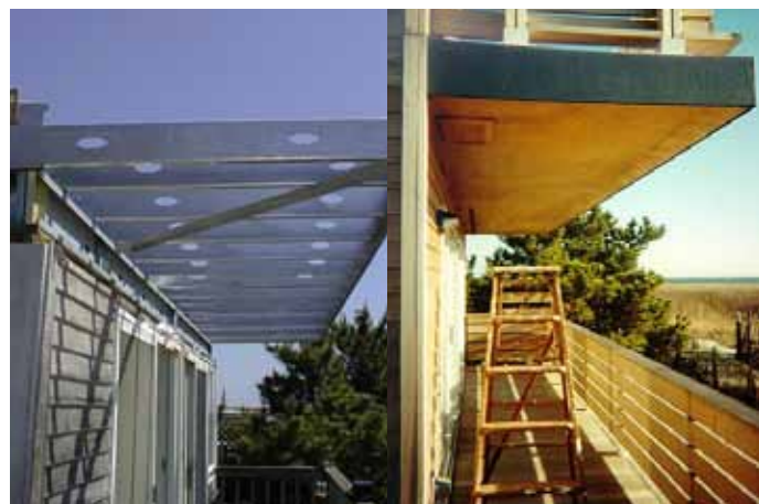
Figure 9 - New Jersey Site Under Construction

humidity and temperature. Building components such as wall studs and floor joists were also monitored for surface temperature, establishing a one year long record of humidity and temperature conditions for the site.