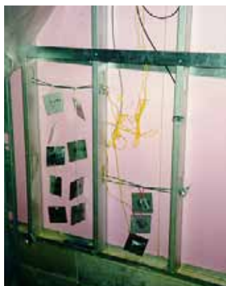
Figure 7 - Wall Cavity Specimens and Sensors in Hamilton, Ontario, Site