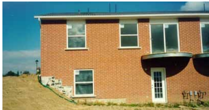
Figure 6 - Hamilton, Ontario Test Site (Rear View)

Three sample colonies were established in the New Jersey site. The first was a full set of stud and plate samples located between the joists that supported the first story. This location should carry some risk of corrosive conditions because it was not immune to infiltration air and outdoor conditions. The second colony was located on a cantilevered deck that hung off the second story of the home and faced the beach (Figure 9). The joist bays under the deck were vented, which presented an opportunity for ocean breezes to deposit salt