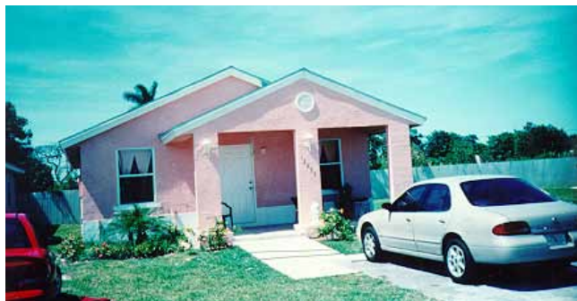
Figure 2 - Miami, Florida Corrosion Site

The sample colony under the decking provided performance data in an extremely aggressive environment.