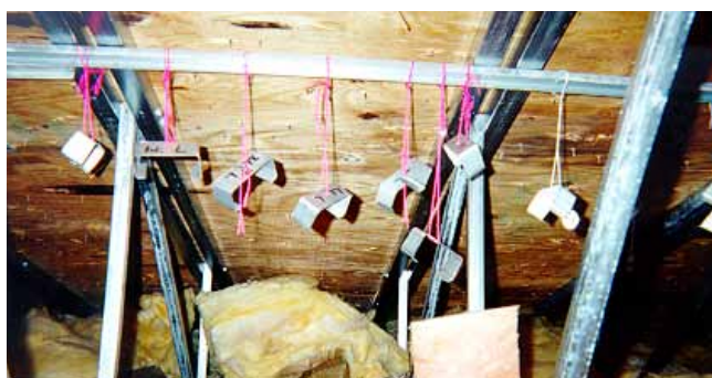
Figure 3 - Attic Specimens in Miami, Florida Site