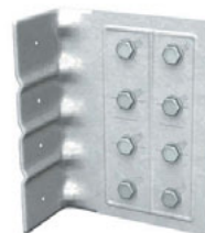
Location Options with (8) Screws