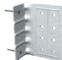
Location Options with (2) Anchors