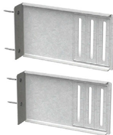
Location Options with (2) Anchors