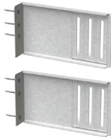
Location Options with (3) Anchors