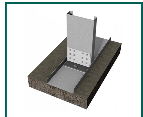
Moment Clip™ Installation